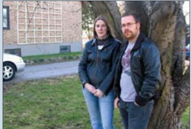
The Centrum för Rättvisa’s eminent domain clients in Burlov, Sweden. Local authorities want to take the couple’s home and give it to DHL, the giant German transport company.

Our most prominent legal victory came in January 2006, when the Swedish Supreme Court unanimously voided an ethnic quota admission system at the Uppsala University Law School, ruling that it violated the Swedish Equal Treatment Act. The law school had earmarked 30 out of 300 first-year law student places for applicants “both of whose parents were born abroad.” The Centrum för Rättvisa filed a lawsuit on behalf of two applicants who did not have