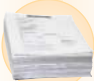
Fall 2001: IJ's brief