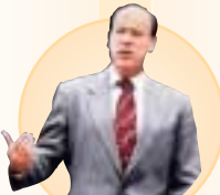
Winter 2001-02: Possible Oral Argument