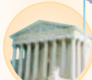
Sept./Oct. 2001: Supreme Court decides whether to review the case

Not only does a split in authority over the constitutionality of school choice exist nationally—the situation in which the court is most likely to grant review—but a split exists between the Ohio Supreme Court and the 6th Circuit over the constitutionality of this program. Only the Supreme Court can resolve that conflict.